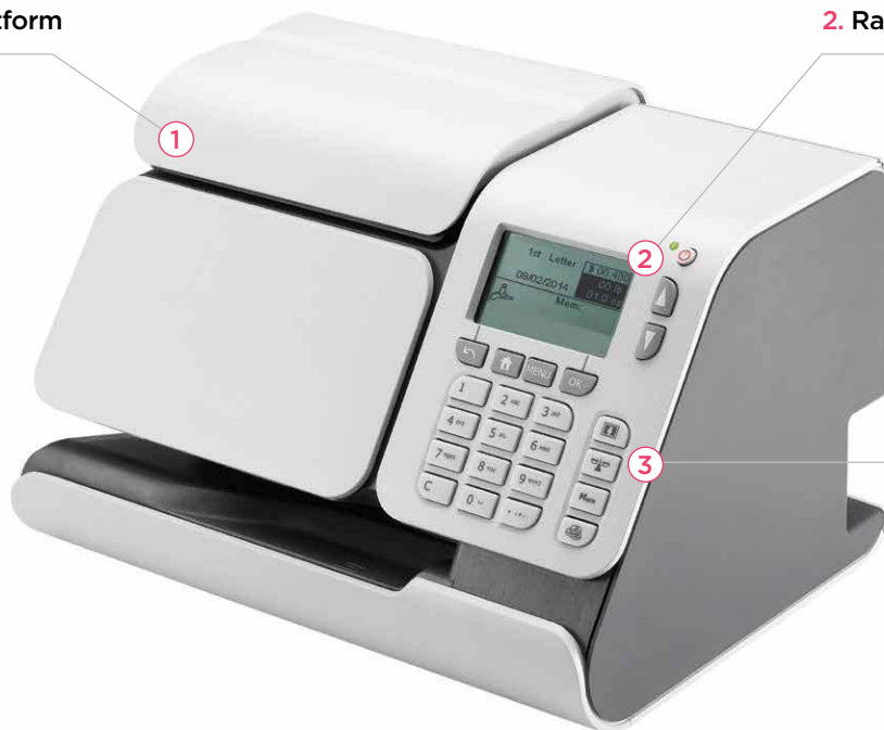
2. Rate Wizard